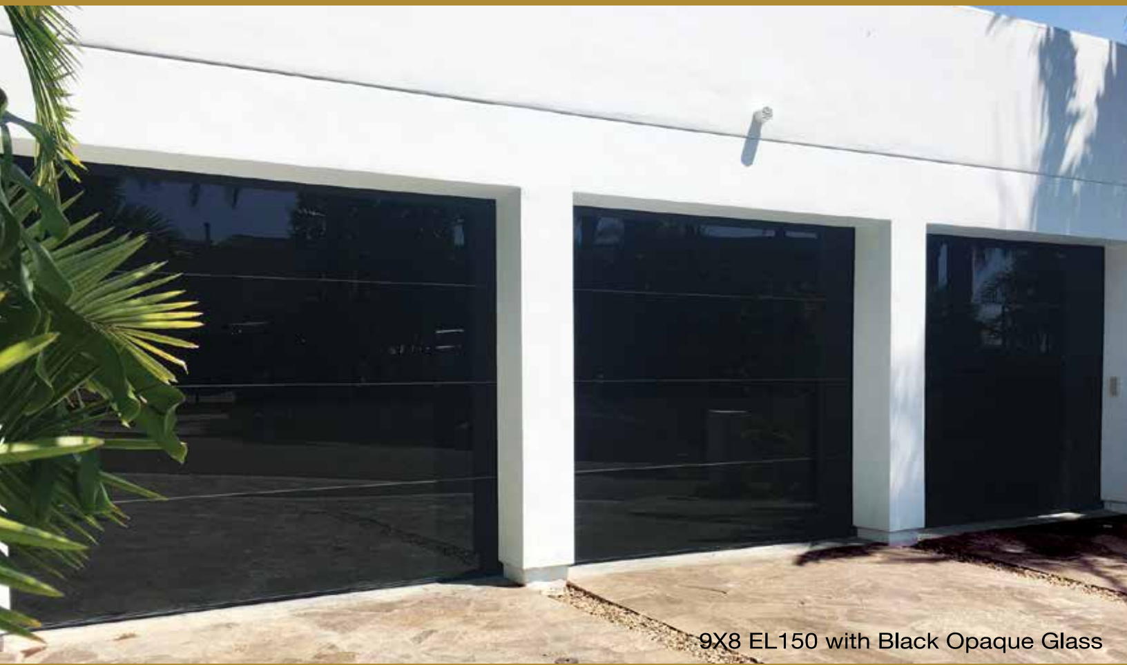
9X8 EL150 with Black Opaque Glass