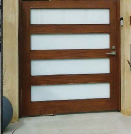
EL5 WOOD GATE