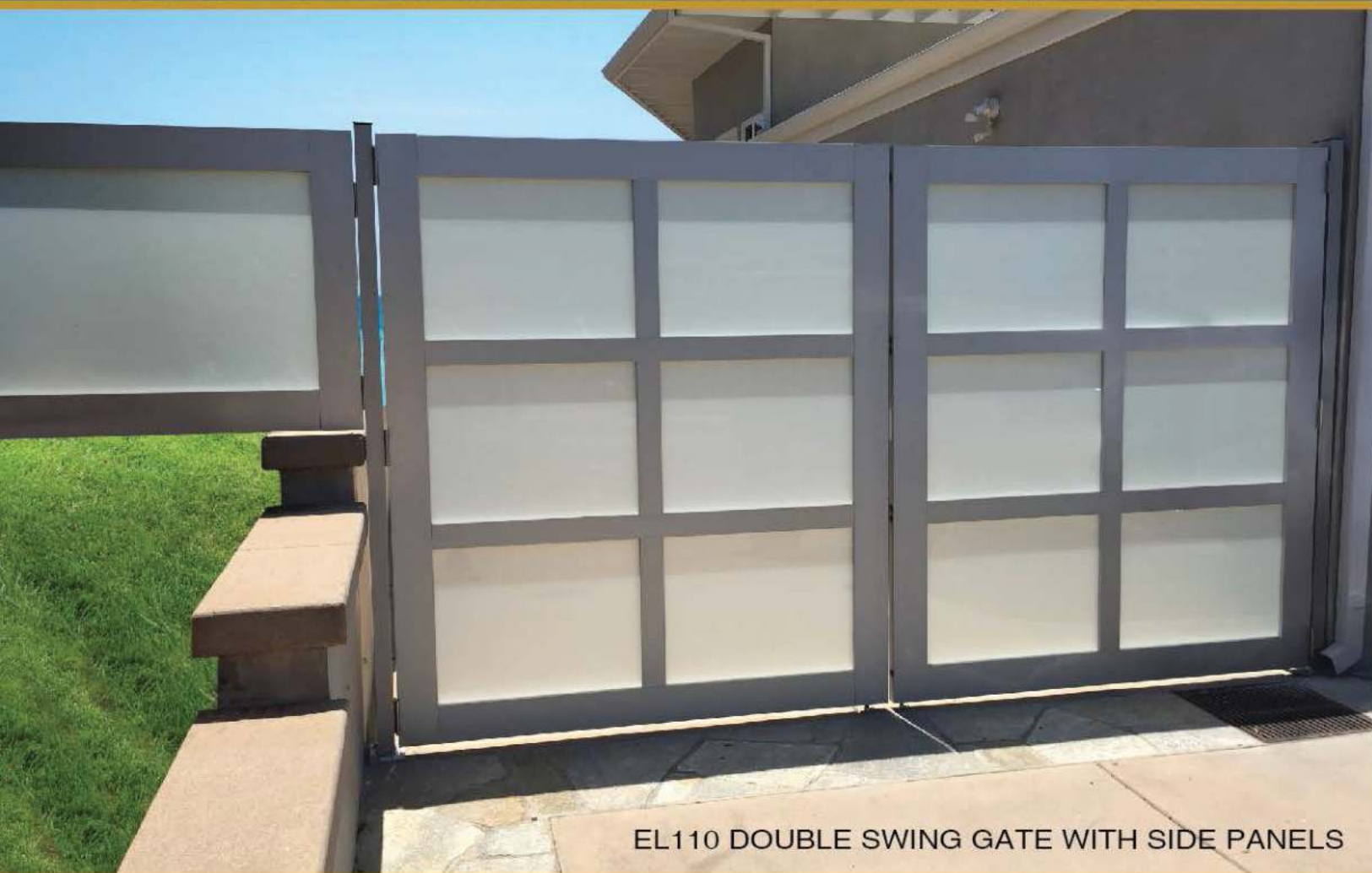
EL110 DOUBLE SWING GATE WITH SIDE PANELS

EL 110 Aluminum Glass Gates EL5 Wood Gates